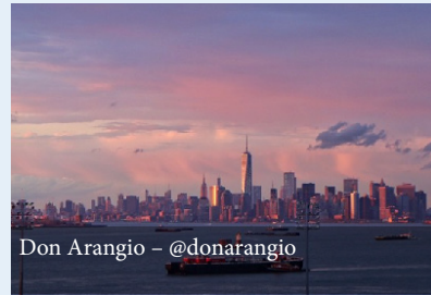
Don Arangio - @donarangio

Whether its the majestic Verrazano Bridge, or the gorgeous parks Staten Island offers some truly beautiful views. Here are some of the best Staten Island Photographers.